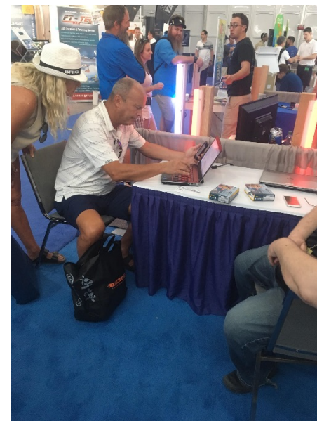
USMCC staff helping a SARSAT beacon owner update their registration information in the RGDB